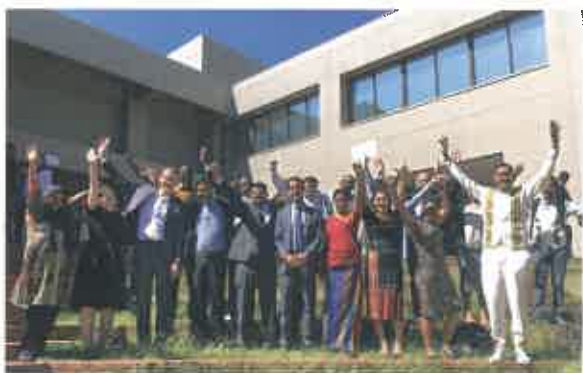
A previous PEPP cohort celebrate arriving on campus following their matriculation ceremony